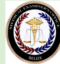
MEDICAL EXAMINER'S OFFICE