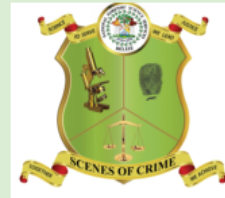
SCENES OF CRIME